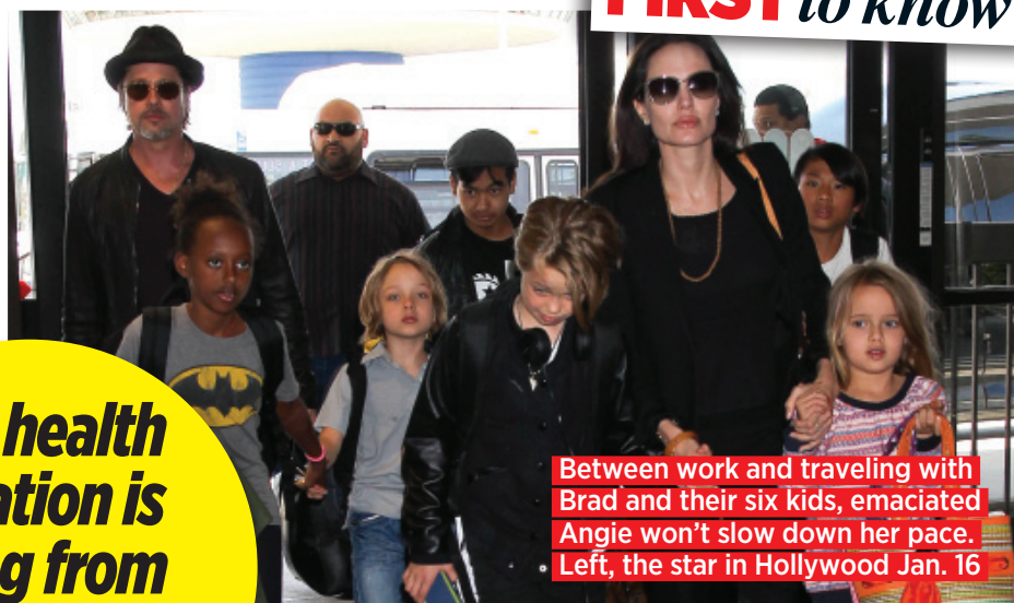
Between work and traveling with Brad and their six kids, emaciated Angie won't slow down her pace. Left, the star in Hollywood Jan. 16

'Her health situation is going from SERIOUS to DIRE'